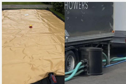
Waste Water Tanks & Pumps