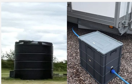
Fresh Water Tanks & Pumps

We can supply extra pipework and are used to solving problems, so if your site does not meet any of these requirements please let us know, we are here to help.